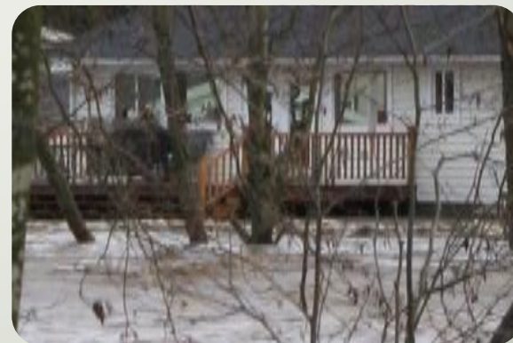
Homes in flood-prone areas may be engulfed by flood waters when rivers or creeks rise.

Please note that reductions of premiums may require reapplication with subsequent insurance renewals, change of carriers, refinancing or sale of the property. Additionally, lending institutions have the right to specifically require flood insurance for any property, whether it is in a flood area or not. Please consult your lender for more information on your loan.