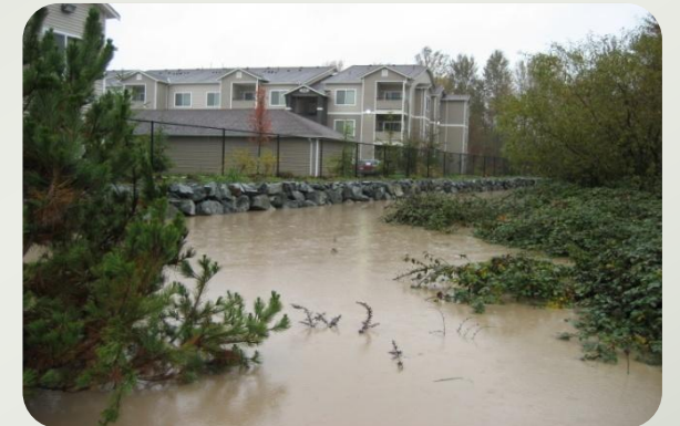
Properties built above the base flood elevation are protected from most flooding events.

Please note that the issuance of a LOMA or LOMR-F does not mean that the property will not flood, rather that the risk of flooding is lower than that of properties located within special flood hazard areas. Additionally, both certifications may require revalidation upon future map changes.